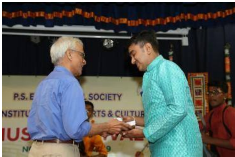
Music Bhajan Classes