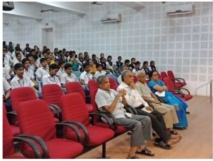
11/10/2018 - Day 4 Concert by P S Senior Secondary School Students